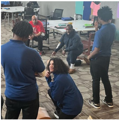
Seniors getting CPR Certified in observance of American Heart Health Month