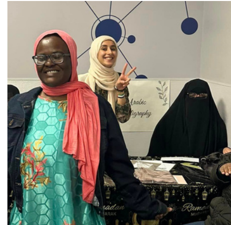
Iftar Night 2024

Iftar Night provided a wonderful opportunity for cultural exchange and understanding within our school community, fostering inclusivity and appreciation for diverse traditions. We look forward to continuing this tradition of unity and celebration in the years to come.